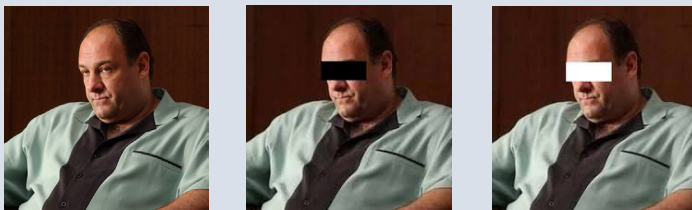
Tony Soprano as displayed in the original PDF document; as displayed after the eyes have been redacted to provide anonymity; extracted image of Tony Soprano (notice that the original content is gone).