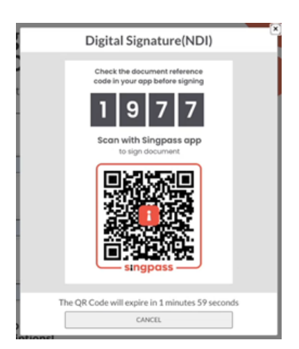
The Sign with SingPass mobile experience

Once a user's digital signature has been captured, they can then download the completed document as a PAdES-compliant